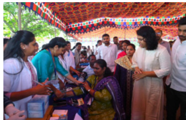
Rajamahendravaram, March 26: A mega free medical camp organized for journalists received an overwhelming