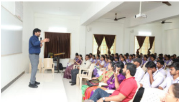
Gandepalli, March 26: An awareness program on "Strategies for Success in Government Exams and Group Services Preparation" was conducted by the Department of