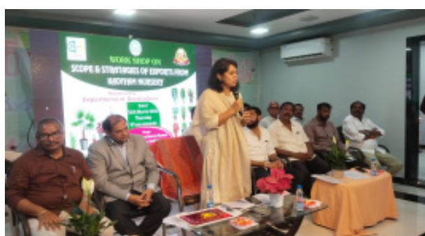
Horticulture officials, nursery farmers, and representatives attended the program.

The Collector highlighted that only 10 firms presently hold export licenses and stressed the need to increase this number. She encouraged farmers to adopt a planned approach targeting global markets, assuring government support for export promotion.