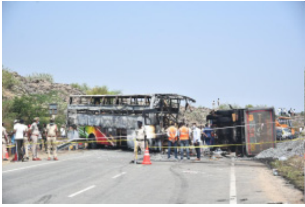
Markapuram, March 26: A tragic road accident near Rayavaram in Markapuram mandal claimed 14 lives on Thursday. A private travels bus collided head-on with a

gravel-loaded tipper, triggering a massive fire after the fuel tank burst. At least 13 passengers were burnt alive on the spot, while one succumbed to injuries in hospital. Around 20 others sustained serious injuries. The bus was carrying 43 passengers at the time of the accident. Both vehicles were completely gutted in the blaze. The injured were shifted to Ongole Government Hospital and Markapuram District Hospital for treatment. Emergency teams reached the spot within minutes and carried out rescue operations. Preliminary reports suggest a possible steering lock failure, as stated by the driver, while officials are investigating all angles. Prime Minister, Andhra Pradesh Chief Minister, Deputy CM, and Telangana CM expressed shock over the incident. Officials, including SP Harshavardhan Raju, inspected the site, and a detailed probe is underway. The government assured full support to the victims' families.