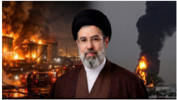
Tehran: Iran's foreign minister has warned Gulf states that any radioactive fallout from attacks on the Bushehr nuclear plant would devastate nearby

Arab capitals before reaching Tehran, sharpening fears that the widening US-Israeli campaign against Iranian strategic sites could trigger a cross-border nuclear emergency. The warning followed what Iranian and international officials described as the fourth strike affecting the Bushehr area in under three weeks. Seyed Abbas Araghchi said on Saturday that "radioactive fallout will end life in GCC capitals, not Tehran" and invoked the international uproar over fighting near Ukraine's Zaporizhzhia nuclear plant to question what Tehran sees as muted Western reaction to repeated attacks near Bushehr. His remarks were carried in a public statement on X and echoed by regional media, giving them a direct public record rather than leaving them as second-hand accounts.