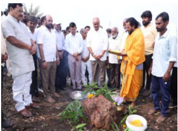
Srikakulam, April 6: Andhra Pradesh Agriculture Minister on Monday visited the R&R colonies of displaced

families from the Mulapeta Port at Naupada in Santabommali mandal. He also launched a program on water security and irrigation users' associations. The minister identified severe drinking water issues in the colonies and directed officials to ensure safe drinking water supply within 90 days. He stressed the importance of rainwater conservation and groundwater recharge, urging villages to adopt water-saving measures and restore ponds and check dams. Highlighting water scarcity, he noted that even at 300 feet depth, water is unavailable in many areas, and called for efforts to improve groundwater levels before the monsoon. He emphasized that water in the ground is like a "reserve bank" for the future. He also reviewed the progress of the Vamsadhara project, stating that major works were completed earlier and efforts are now being made to resume pending works and improve irrigation facilities.