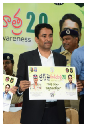
Vijayawada, April 6: The NTR District Police Commissionerate, in coordination with the district