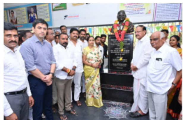
Chittoor, April 9: Former Vice President Muppavarapu Venkaiah Naidu emphasized the importance of mother tongue, Indian identity, and value-based education while

addressing students at the 44th annual and graduation ceremony of a government women's degree college in Chittoor.