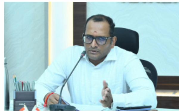
District officials and representatives of various political parties attended the meeting.

He also informed that the number of polling stations in the district is proposed to increase from 1,640 to 1,825 after rationalization, with changes in locations and names of several centers. Political parties were advised to appoint Booth Level Agents for each polling station.