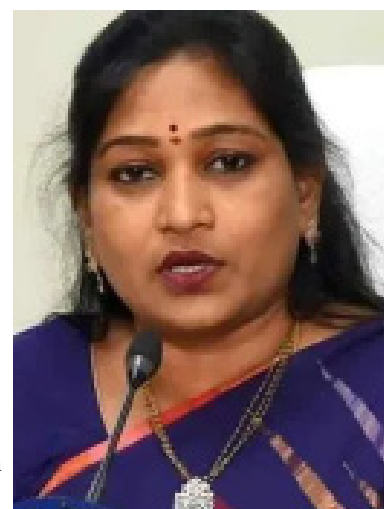
the accident. State Home

Hospital. The house was completely destroyed in