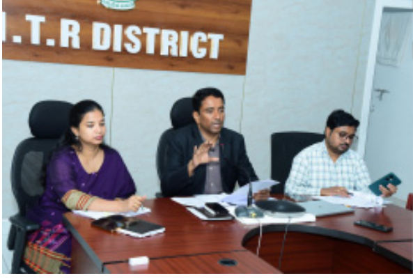
departments and support from media are crucial for the success of the program.

He informed that citizens can provide details such as family members, housing status, water source, internet access, and other key information through the online portal. A 15-day outreach campaign will also be conducted to create awareness among different sections of society.