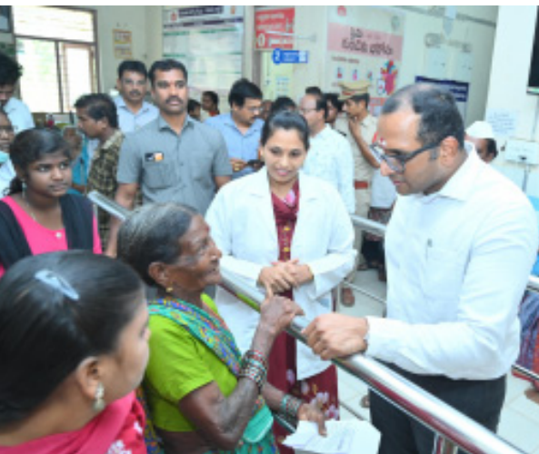
from various departments accompanied him.

During his visit to an Anganwadi centre, he checked nutrition quality and advised following the prescribed menu. He also stressed improving basic English and math skills among children. Expressing concern over a teacher's absence at a nearby primary school, he ordered issuance of a show-cause notice. The Collector inspected Secretariat-9, reviewed sanitation, drinking water, streetlights, and waste management, and later visited Nagaravanam, directing officials to speed up ongoing works. Officials