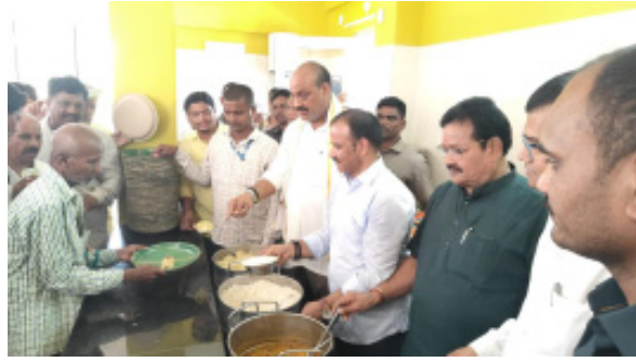
Srikakulam, April 15: State Agriculture Minister said Anna Canteens have been set up to provide full

meals at just ₹5 for the poor, daily wage workers, and the needy. He inaugurated a new Anna Canteen building at Tekkali along with District Collector. The minister stated that 207 Anna Canteens are already functioning in municipalities and corporations across the state, and 67 new canteens are being launched in rural areas. He expressed satisfaction that two canteens are operating in Tekkali constituency.