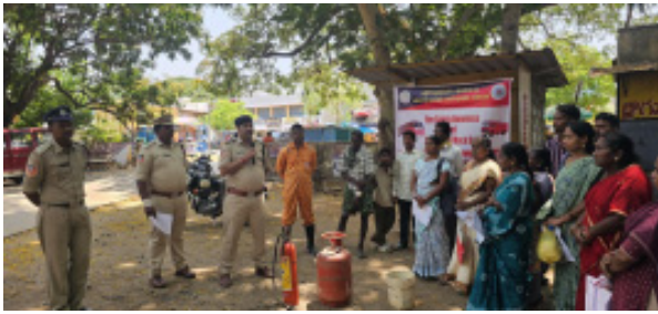
across the district under the supervision of District Collector K. Dinesh Kumar.

He advised checking gas leaks, avoiding electrical overloading, keeping flammable materials away from kitchens, and ensuring proper ventilation. He also warned against careless handling of cigarettes and matches.