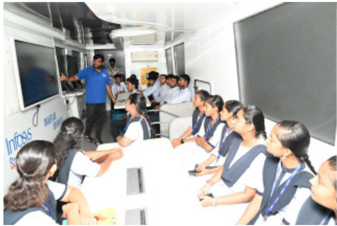
Gandepalli, May 11: The AP Maker Lab-On-Wheels, implemented by the Andhra Pradesh State Skill Development Corporation, was intro-

duced at Aditya University to create awareness among students about emerging technologies.